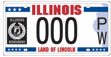
POW/MIA Illinois Remembers