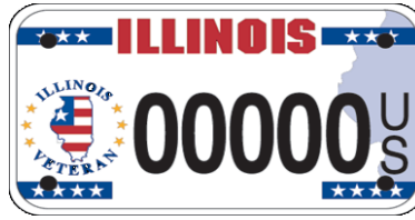
Universal Veteran Motorcycle