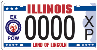
Ex-Prisoner of War