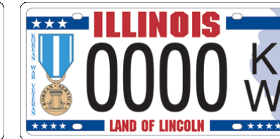
Korean War Veteran