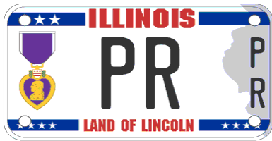
Purple Heart Motorcycle