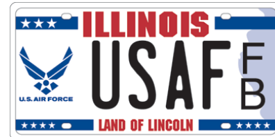
U.S. Air Force