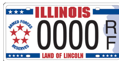
Armed Forces Reserves