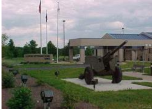
Illinois Veterans Home, 792 N. Main Street, Anna, IL 62906 Tel: (618) 833-6302

This modern, single story structure opened in August 1994. Situated on 16 acres, the Home provides skilled nursing care services to eligible veterans. The Home has a 50-bed nursing care capacity and twelve beds in six adjoining apartment-style domiciliary units.