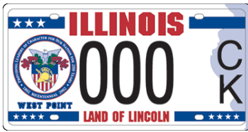
West Point Bicentennial