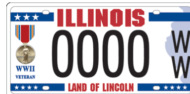
World War II Veteran