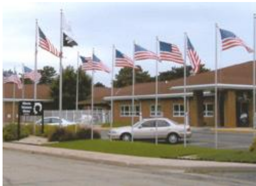
Illinois Veterans Home, 1015 O'Conor Avenue, LaSalle, IL 61301 Tel: (815) 223-0303 ext. 210

This modern, single story structure opened in August 1994. Situated on 16 acres, the Home provides skilled nursing care services to eligible veterans. The Home has a 50-bed nursing care capacity and twelve beds in six adjoining apartment-style domiciliary units.