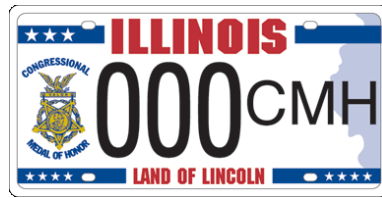
Congressional Medal of Honor