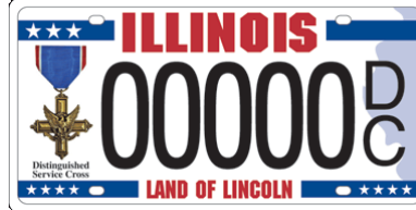
Distinguished Service Cross