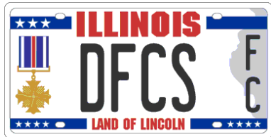
Distinguished Flying Cross