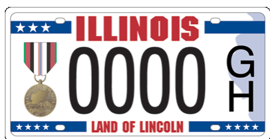
Afghanistan Campaign Medal

The below plates are available to Veterans who qualify. To determine eligibility requirements, costs, availability, and renewal procedures click on the title of the plate below that you would like to obtain.