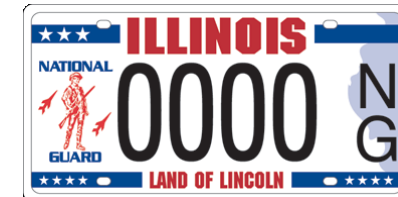
Illinois National Guard