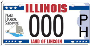
Pearl Harbor Survivor