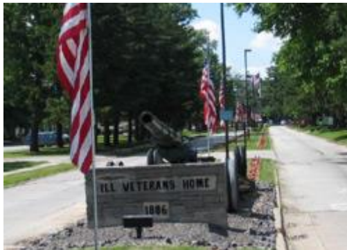
Illinois Veterans Home, 1707 N. 12th Street, Quincy, IL 62301 Tel: (217) 222 – 8641

units and two ancillary service and support buildings. They provide care for up to 294 Skilled Care and Special Needs Veterans.