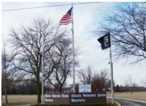
Illinois Veterans Home, 1 Veterans Drive, Manteno, IL 60950 Tel: (815) 468 – 6581

The LaSalle Veterans' Home opened in December 1990. Located in a residential area on the northeast side of LaSalle in LaSalle County, on a campus of slightly more than four acres, the Home provides skilled nursing services for veterans. They provide care for up to 184 Veterans, to include 40 special needs veterans.