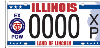
Ex-Prisoner of War